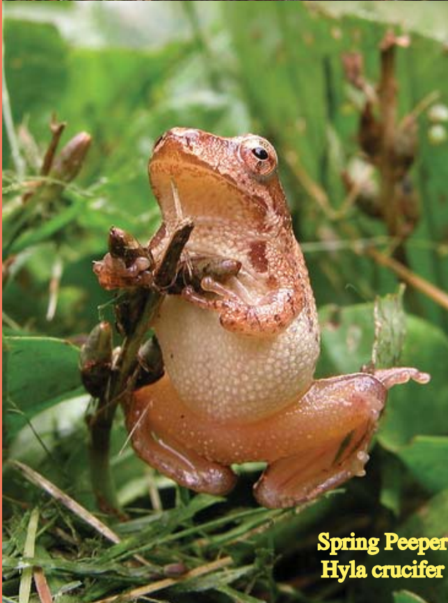
Spring Peeper Hyla crucifer

This wierd looking critter is known as Siren intermedia , its common name is siren. Sirens are similar to salamanders, but look more like eels! They are amphibians, because they have all three important characteristics, but unlike most amphibians, sirens never develop past the larval stage. They don't grow back legs, and they have both lungs and gills their whole life. Also, because they don't have any back legs to help them move on land, they spend their whole life in the water.