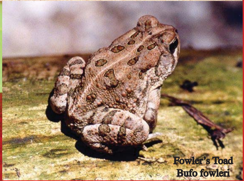
Fowler's Toad Bufo fowleri