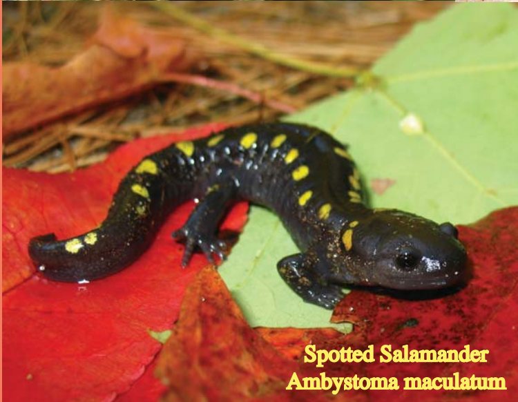
Spotted Salamander Ambystoma maculatum