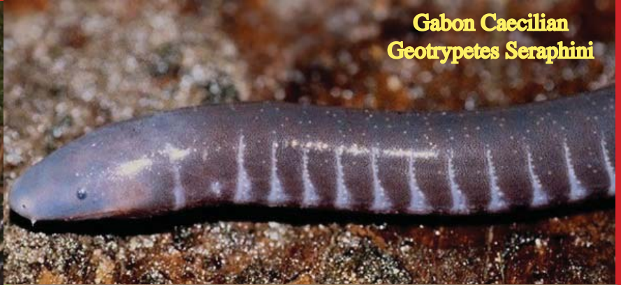
Gabon Caecilian Geotrypetes Seraphini