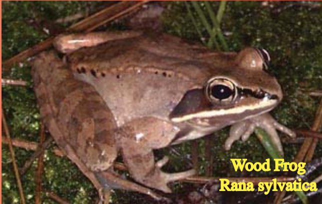
Wood Frog Rana sylvatica